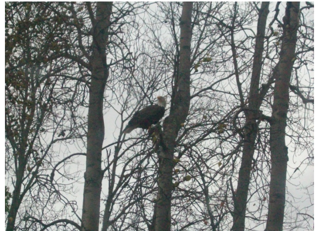
Eagle photo by Dan Parker

of total lot size. (This is because impervious surfaces of more than 10% adversely affect water quality.) Again, if the total of impervious surfaces is between 15 and 30 percent of the lot size, property owners would be required to take measures to offset the environmental impact of any proposed project.