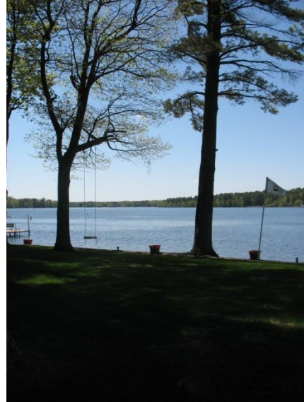
What a view!!!