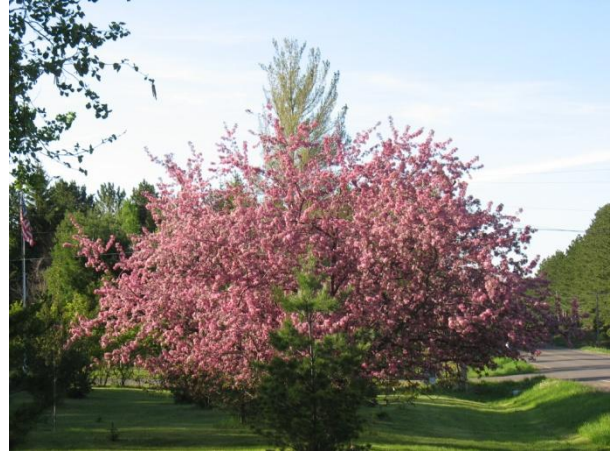
Isn't it wonderful to see some color again after the long monochrome winter and brown spring?

Someone once said that living in Lake Nebagamon is like living in the fifties, which is one of the main reasons we moved here. Respecting the lake and one another is what will make this summer one to remember. Let's continue to be good neighbors and help one another out by taking care of our lake!!!