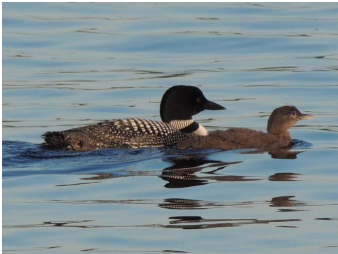
Photo taken of loon chick on Lake Nebagamon, 2016