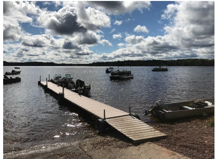
The boats gather around the boat launch in preparation for the volunteer led walleye stocking in October 2017.