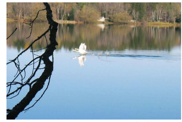
Swans on Lake Nebagamon

"Debris burning (brush, leaves, burn barrels) is a major contributor to wildfires in Wisconsin. Most of these fires occur before 6:00 p.m., and are often a result of people burning without a permit and burning illegal items. Permits restrict burning to times when weather conditions are more favorable." In fact, debris burning causes 32% of wildfires—the highest cause of such fires. The next most frequent causes are equipment (18%), arson (9%), and miscellaneous causes (11%). Campfires cause only 4%, fireworks cause 5%, and lightning causes only 2%. Let's be careful and have a safe summer!