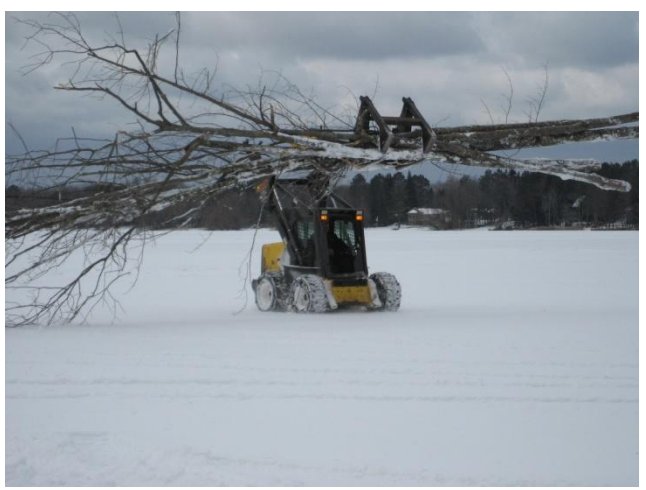
Fish sticks work, winter 2011-12

The "Fish Sticks Project" was completed February 20-23, 2012, by Scott Toshner, DNR Fishery Biologist and the Fisheries Crew. The major work was contracted to Gruel Landscaping Firm. This type of work is done in the winter on the ice. Fish Sticks are complete trees that are put in the water. These fish sticks mimic Mother Nature's efforts when trees fall into the lake and provide this natural habitat.