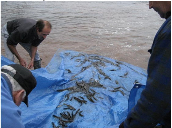
Fish stocking, fall 2011