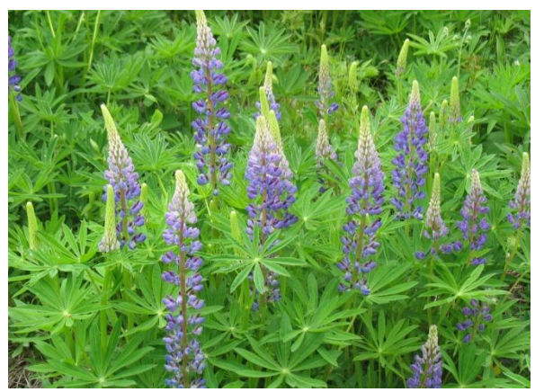
One of our first spring flowers—lupines.