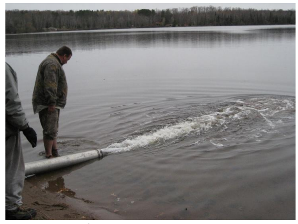
Fish stocking, fall 2011

Installed the first "fish sticks project" at 9 locations for a total of 1,875 frontage feet scattered around the lake. The major area was on the west portion of the Boys' Camp frontage. The purpose is to provide needed habitat and cover for the young fish and other aquatic species—habitat that has been lacking on Lake Nebagamon. This was a DNR project with federal funds. We plan to do another "fish sticks" project in 2013.