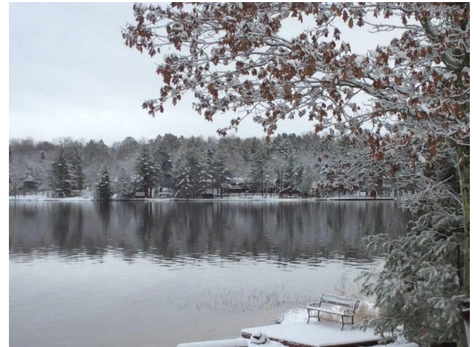
Janet Bloomquist captures the scene in mid-December with no ice on the lake

*Calling all photographers* – we need more pictures around Lake Nebagamon to be featured in this newsletter and on our Facebook page. Please share pictures on our Facebook page or send to lakenebagamonwisconsin@yahoo.com .