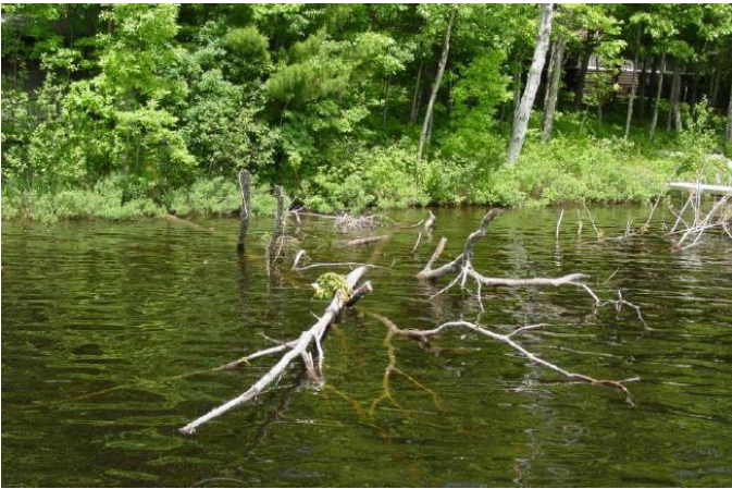
Fish Sticks can be brought in by the DNR as well!