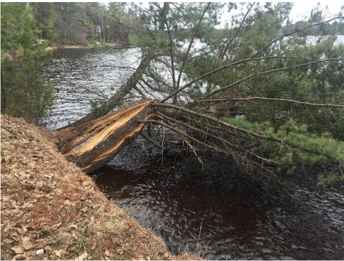
“Fish Sticks” – brought to us the old fashioned way this winter....