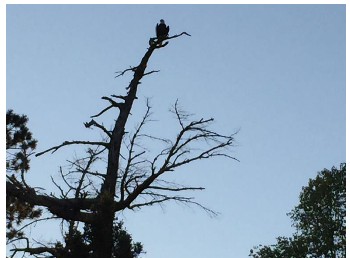
Our eagles are back on Honeymoon Point as always!

Finally, you can take advantage of our online payment option for dues! Go to http://nebagamonlakeassociation.com/pay-online/ +++++