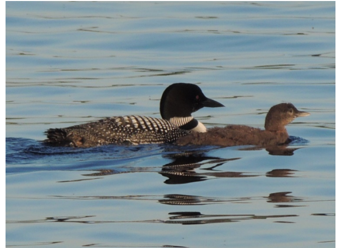
Photo taken of loon chick on Lake Nebagamon, 2016