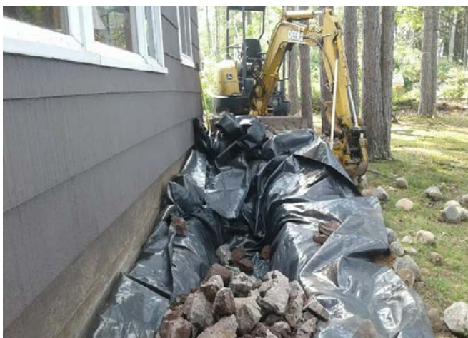
Permeable filter fabric installed in an infiltration trench to mitigate runoff from large rainfalls.