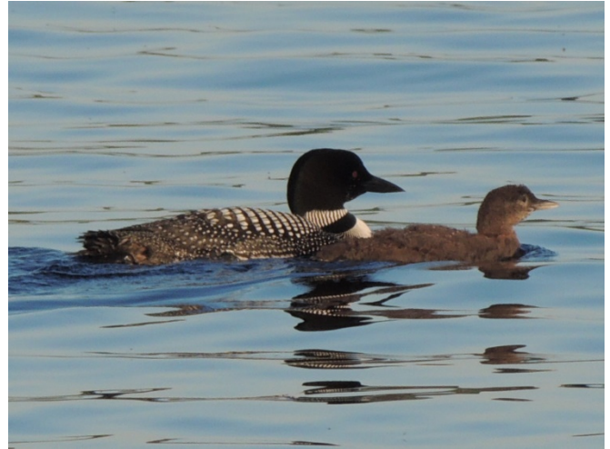
Photo taken of loon chick on Lake Nebagamon, 2016

A side note. The Wisconsin Loon Population Survey (WLPS), which is done every 5 years, will take place on July 18th, between 5am and 10am. Volunteers will take a 2020 census on 258 pre-selected lakes throughout 27 northern Wisconsin counties.